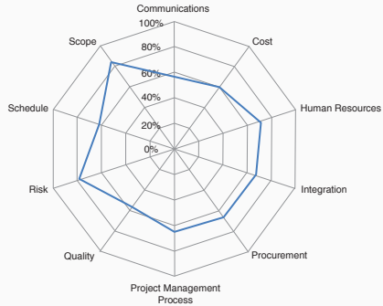
Example: Scores across 10 knowledge areas